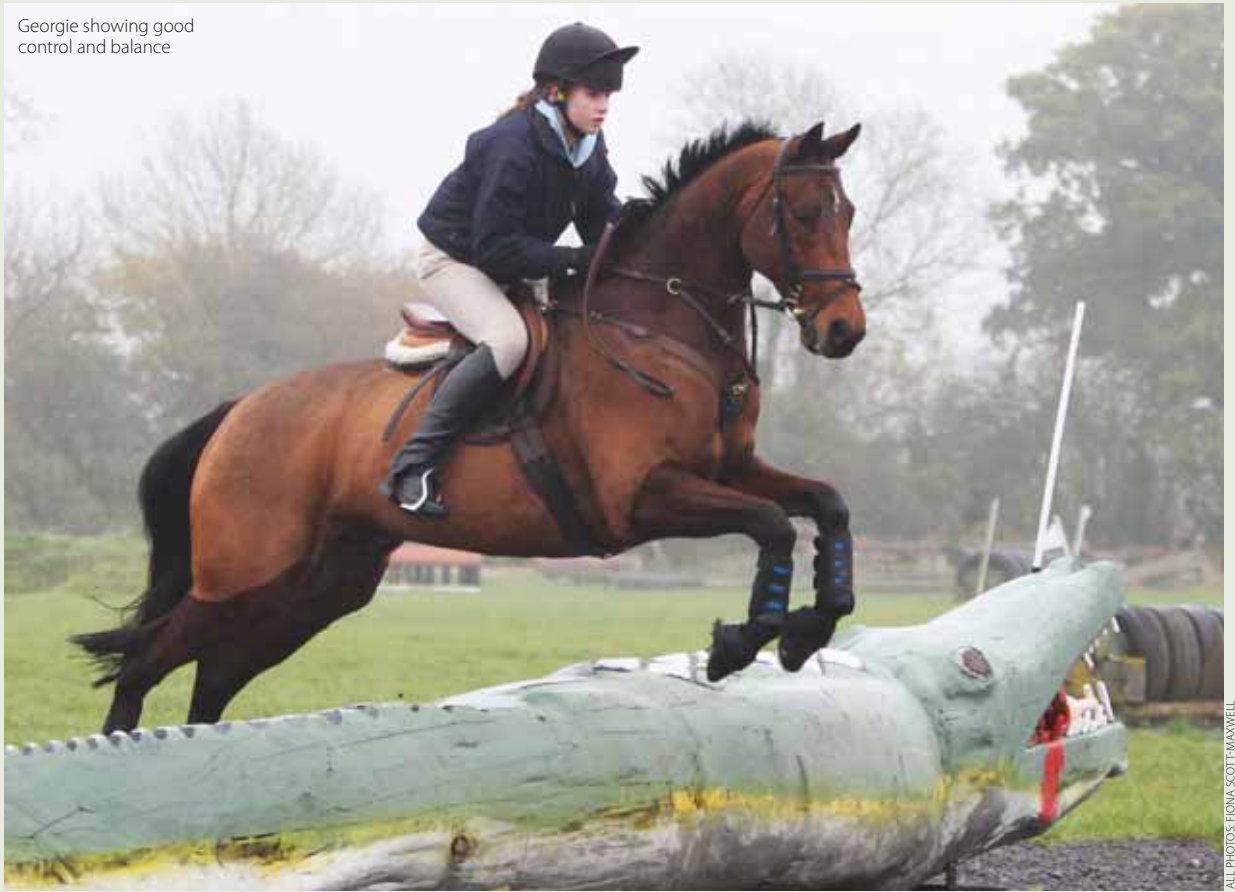
Georgie showing good control and balance